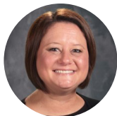
NICOLE BLACKLEY (AP)