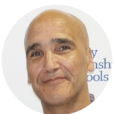
TIM LOVEJOY (P)