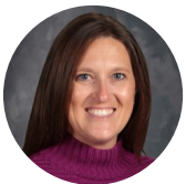
KRISTEN ISBELL (AP)