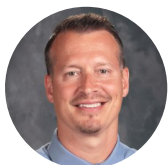
KYLE SCARINGE (AP)