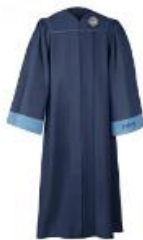
Custom Rental Gown, Cap & Tassel Unit

You may order directly from the website at: PERRY MERIDIAN HIGH SCH | Herff Jones . Remember, the only items you must purchase for graduation are the cap/gown/tassel. The total cost with tax is $49.22 (the website will say $46 because that is before taxes are added). The gown is a rental and will be returned immediately after commencement, but the cap/tassel you keep forever. You will have an opportunity to order a variety of different packages/graduation items. If you only want to order the required items, click on "Graduation" then "Grad Gear and Apparel" (top right) and scroll to the picture below which says,