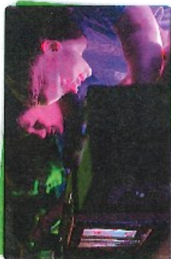
Second graders explore STEM concepts through glowing circuitry and hands-on projects.