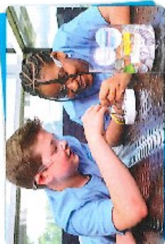
Fourth graders gain confidence while reverse engineering their robotic 3-on-2 wheels.