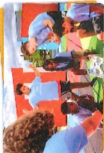
Fifth graders build collaboration skills as they create their own sports ball, game board and brand.