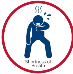
Shortness of Breath